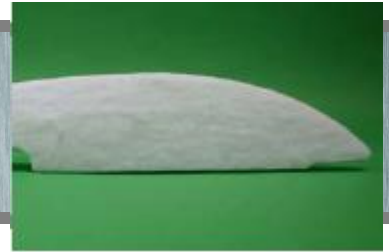
Lydall Random Incidence Sound Absorption